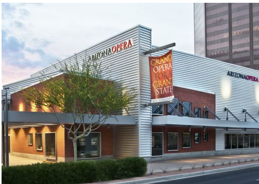
The new Arizona Opera Center building.